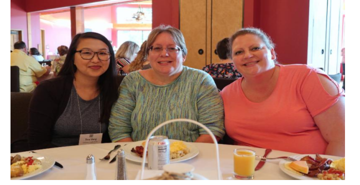
Clients enjoying their breakfast