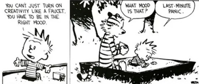
Watterson, Bill. The Essential Calvin and Hobbes: A Calvin and Hobbes Treasury. , 1988. Print.

Save yourself some last-minute anxiety and run your 672 and 802 survey reports every couple of weeks to keep them up to date. Update them weekly when your survey window is open. Address setup issues and how-to questions ahead of time to reduce the stress level when the survey team walks into the building.